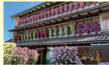
Kasama Chrysanthemum Festival

Historic shrines and temples, and seafood, etc. Autumn: A Season of Art and Gastronomy You can fully enjoy