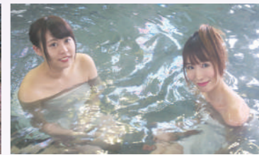
Yukkura Health Center