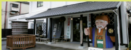
Besshunkan Museum of Umeshu (Plum Wine) & Sake

Ibaraki boasts the largest number of sake breweries in the Kanto region. Mito, which prospered as the castle town of the Mito Tokugawa family, is home to two long-established sake breweries. There is also a museum where visitors can learn about sake and plum wine's history and production process.