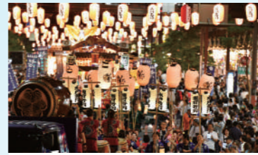
Mito Komon Festival

A treasure trove of outdoor activities with mountains and oceans. Summer festivals, fireworks and swimming in the ocean, etc. You can experience fun events.