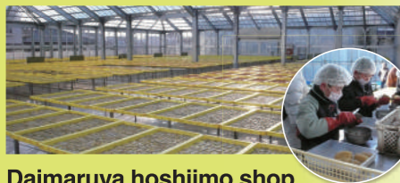
Daimaruya hoshiimo shop

Hitachinaka City's specialty is hoshiimo, dried sweet potato, which is widely available to enjoy and compare different flavors. Popular products include getato, baked goods, shocho, and more made from hoshiimo. We are committed to producing safe and trustworthy food products with no additives.