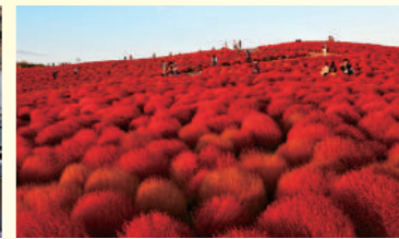
Kochia (autumn leaves)