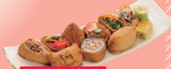
Kasama Inari Sushi

Fresh, raw baby sardines landed at local fishing ports offer a unique flavor characteristic of their origin. Additionally, whitebait boiled in a large pot with salt and then drained is called "kama-age shirasu," offering a plump texture and delicious taste.