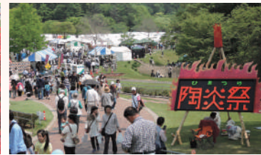
Kasama Pottery Festival