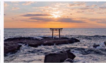
Kamiiso no Torii