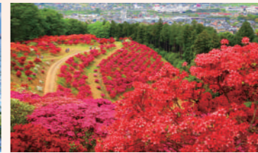
Kasama Azalea Festival