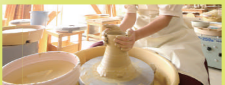
Kasama Craft Hills

There is a pottery experience class for Kasama-yaki, a permanent exhibition of ceramic art, a craft café where you can enjoy coffee, cakes, and meals, and a souvenir corner. On the first floor gallery, seasonal exhibitions by various artists are held, adding color to the spacious indoor space.