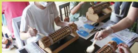
Suzuki Mohei Shoten

Kasama City is the top-ranked area in Japan for growing chestnuts and has the most significant number of chestnut growers. The chestnuts grown here are known for their sweetness and fragrance, and the city offers a wide variety of gourmet foods made from chestnuts, such as fresh and roasted chestnuts, chestnut cuisine, and chestnut delicious sweets.