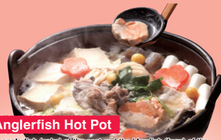
Anglerfish Hot Pot

It is said that natto (fermented soybeans) was originated in ancient times when Lord Minamoto no Yoshiie put boiled soybeans and straws together to feed his horses. When the Plum Viewing Train arrived at Mito Station, it became nationally famous for selling "waratsuto natto" through the train windows.