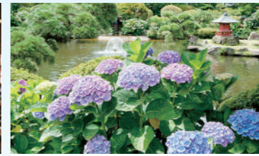
Mito Hydrangea Festival