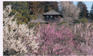
The Mito Plum Blossom Festival

Power spots that purify the body and mind and there are also many popular photo spots, and plum blossoms begin blooming early in February.