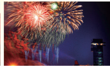
Oarai Maritime Fireworks