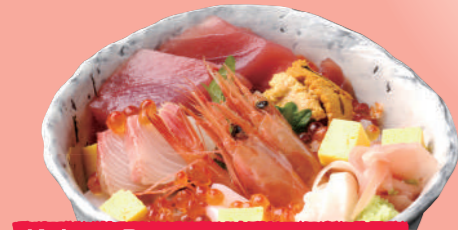
Kaisen Don (Seafood Rice Bowl)

Lots of delicious food! Let's indulge in the taste of gourmet cuisine