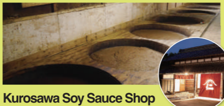
Kurosawa Soy Sauce Shop

Kurosawa Soy Sauce Store in Hitachinaka City offers a tour of the brewery where soy sauce is made. Inside the shop, you can also enjoy sweets made with soy sauce.